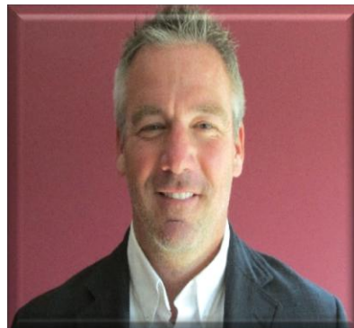
Kevin Walsh T&D and Smart Grids