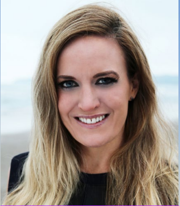
Éimear Noone Award-winning Composer & Conductor